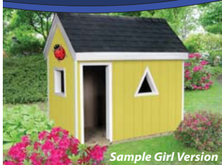
Sample Girl Version