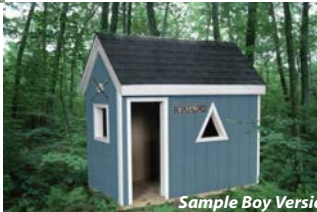
Sample Boy Version