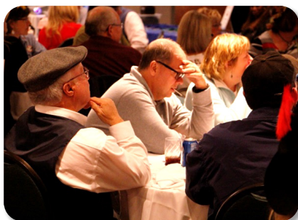
George's Geniuses puzzle through the night's trivia.

George's Geniuses once again walked away winners of The Brain Game , the CAN Council's annual trivia competition. Bavarian Inn Lodge hosted the Geniuses and 27 competing teams October 27 th . The evening's questions challenged the buffest of trivia buffs and secured critical funding for our CASA (Court Appointed Special Advocate) program. CASAs are highly trained volunteers serving as the voice for children who are in the system due to abuse or neglect.