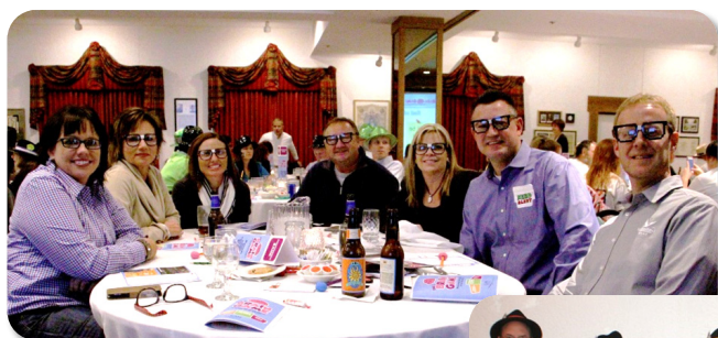
AGP & Associates, Inc. wins the costume contest yet again!

Stay tuned for the exciting changes planned for our 2016 trivia contest!