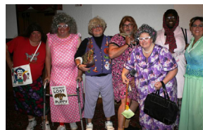
Best Costume, tied for first: Garber Gals

This sold-out event wouldn't have been a success without generous supporters including Bavarian Inn Lodge, AGP & Associates, Inc., The Paris Academy, Emil Rummel Insurance, Duperon Corporation, Garber Management Group, Wildfire Credit Union, Frankenmuth Credit Union, Mike Young Buick GMC, Saginaw County Parks & Recreation Commission, Schaeffer & Bierlein of Frankenmuth, Tri-Star Trust Bank, Saginaw Medical Federal Credit Union, Star of the West Milling Co., The White House Boutique, St. Mary's of Michigan's Field Neurosciences Institute, and PepsiCo. Thank you for sharing our belief that child abuse and neglect is unacceptable!