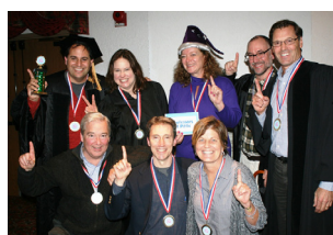
Professors of Piffle 1st Place