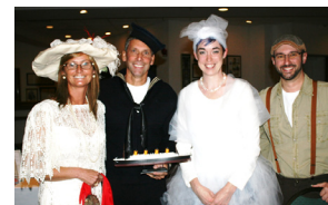
Best Costume, tied for first: Titanic Survivors