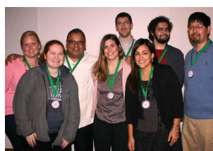
Silent, But Deadly 3rd Place

Preventing child abuse is far from trivial. All proceeds from this event benefitted CAN's Court Appointed Special Advocate (CASA) program, providing highly-trained volunteers serving as the voice for children who are in the court system due to abuse or neglect.