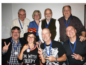
Patchwork Anamnesis 2nd Place